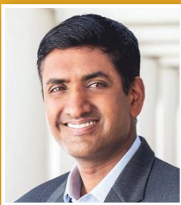
Congressman RO KHANNA