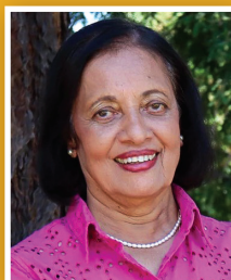
Mayor of Cupertino SHEILA MOHAN