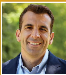
Former San José Mayor SAM LICCARDO